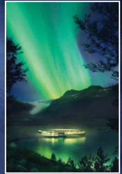
Artist Impressions courtesy of Snøhetta/Plomprozes

Building an energy positive and low-impact hotel is an essential factor to create a sustainable tourist destination respecting the unique features of the plot; the rare plant species, the clean waters and the blue ice of the Svartisen glacier. Opening in 2021.